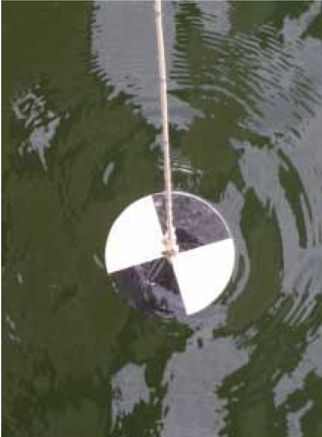
Figure 3: A black-and-white Secchi disk as used in limnology.