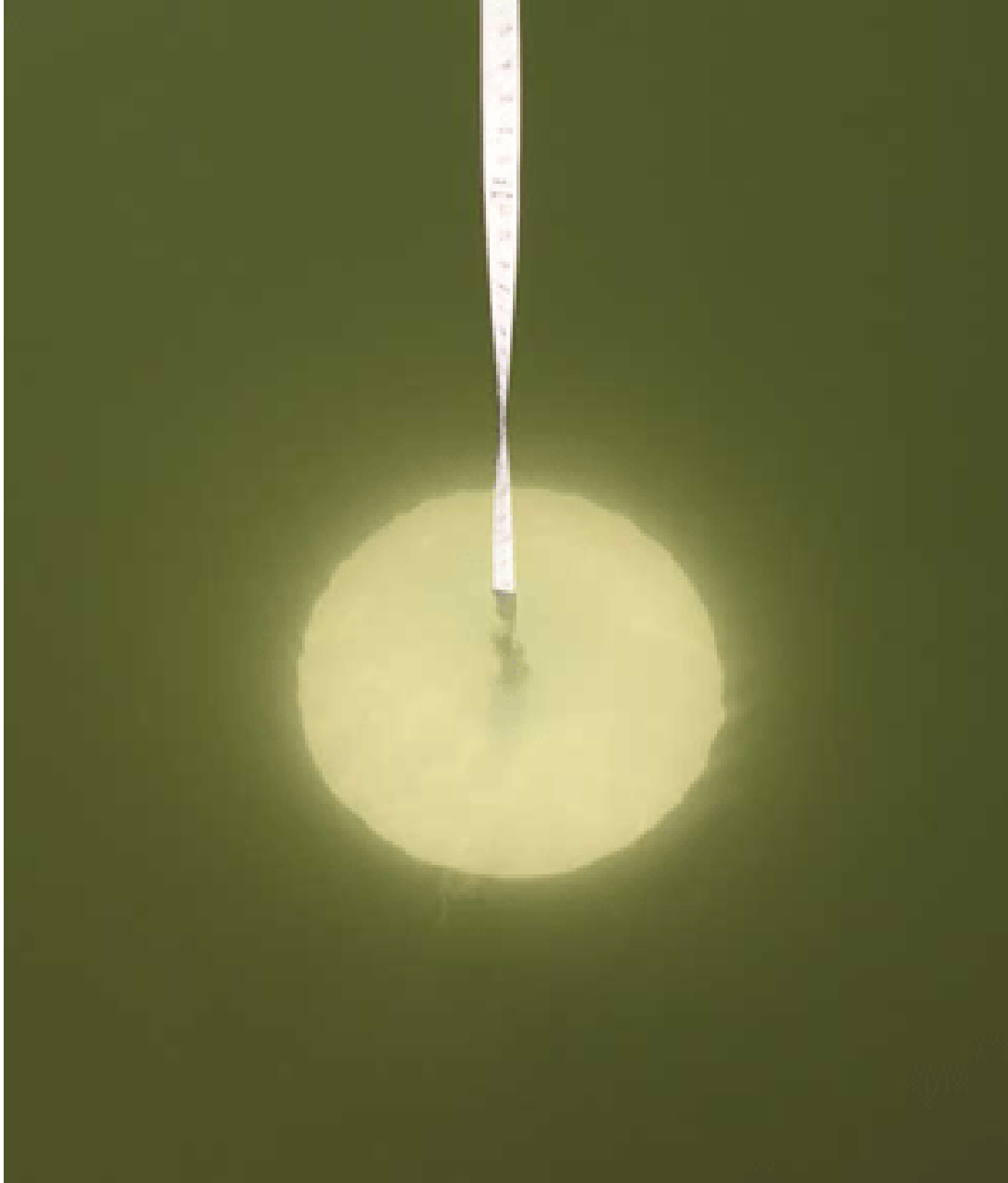
Figure 2: A Secchi disk being lowered into greenish water.