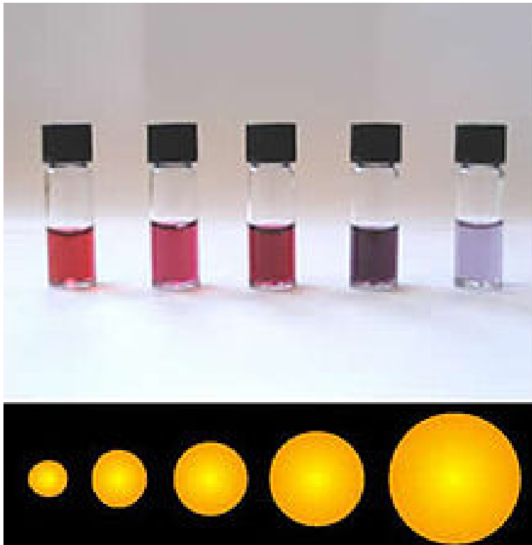
Figure 2: Suspensions of gold nanoparticles of various sizes showing a range of colors.